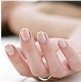
Cure Ringworm of The Nails