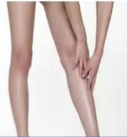
Blood Vein Removal